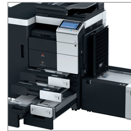
PAPER MANAGEMENT up to 6,650 cut sheets