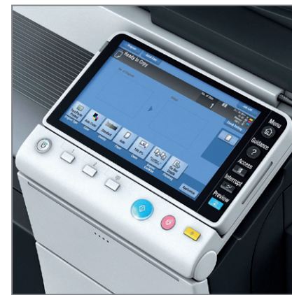
9.5" MULTI-TOUCH CONTROL PANEL

An innovative line of easy-to-use multifunctional colour devices offering outstanding performance and care for the environment, intended for medium and large workplaces and for print centres in particular.