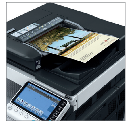
STANDARD DUAL SCANNER up to 180 opm

preview of the scanned document. As from today, PDF A format scanning is also available which, together with the OCR "engine" , supports electronic storage requirements.